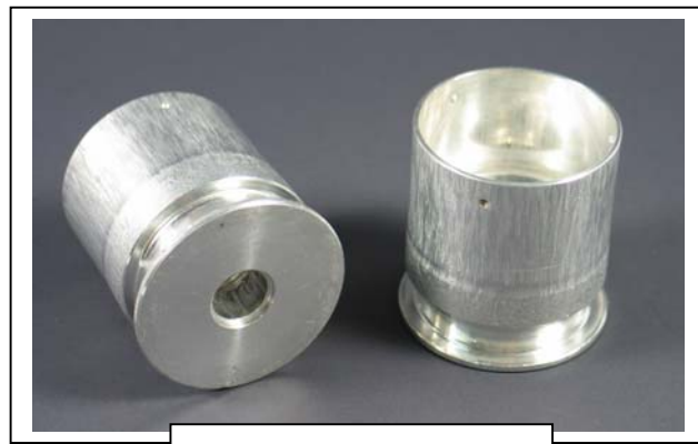
Replacement Cartridge Cases:

Stock Number: 101151 Model Number: KO41/CC