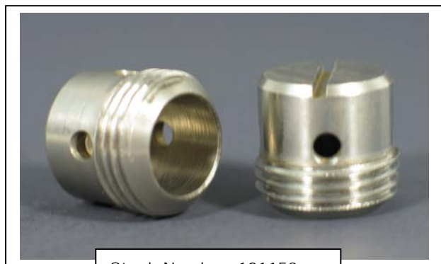
Replacement High Pressure Chamber:

Stock Number: 101152 Model Number: KO41/HPC