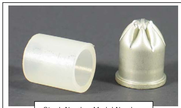
Replacement Propelling Charge & Delay Tube:

Stock Number-Model Number: 101075-KO41/LESPC 101077-KO41/MRSPC 101076-KO41/SPC