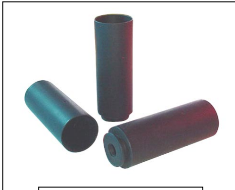
Replacement Cartridge Cases:

Stock Number: 101103 Model Number: KO1-CC