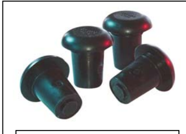
Replacement Baton End Caps:

Stock Number: 101104 Model Number: KO1-EC