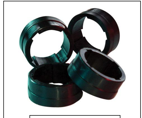
Replacement Rotating Bands:

Stock Number: 101104 Model Number: KO1-EC